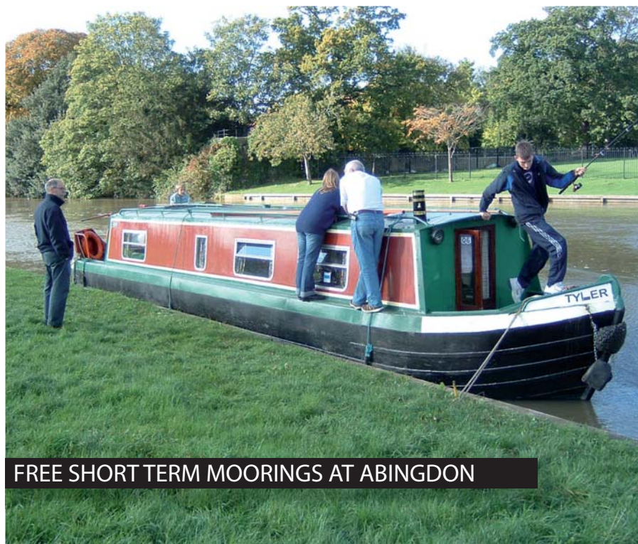
FREE SHORT TERM MOORINGS AT ABINGDON