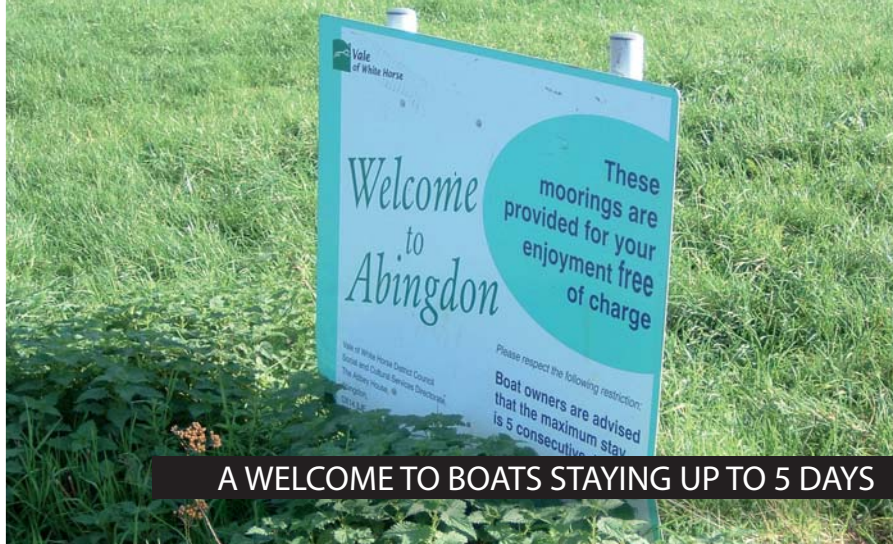
A WELCOME TO BOATS STAYING UP TO 5 DAYS

( www.jdboats.co.uk ) was also not suitable as the share is restricted to the same two consecutive weeks each year (e.g. during May or late July) with the chance to bid for a further two 'floating' weeks between October and April.