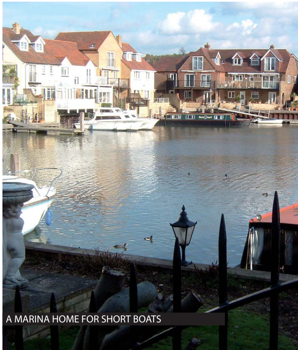
A MARINA HOME FOR SHORT BOATS

Being realistic, we didn't think we would take more than 5 weeks' holiday a year. This meant that we didn't need to own anything like a third or half share but would be happy with 1/12th. With several weeks set aside for maintenance, this meant a guaranteed four weeks a year as well as the possibility of extra weeks if someone had to cancel their time on the boat.